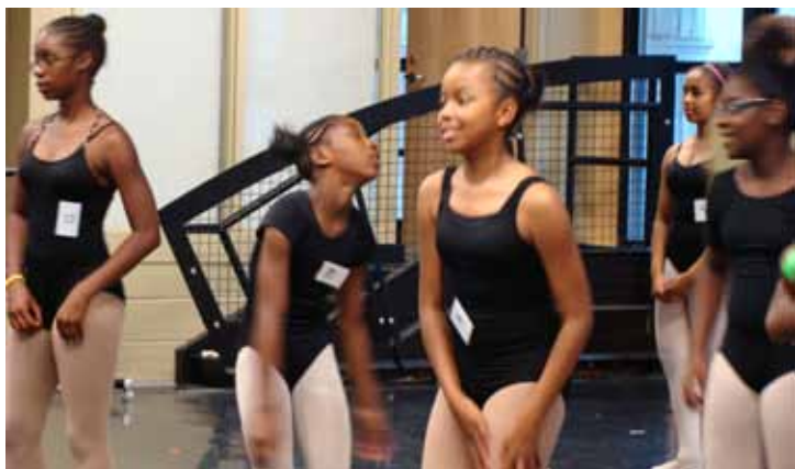
With Art In Mind summer

This year's summer program was a huge success. "WAIM" ("With Art in Mind"), was aimed at reaching 50 Detroit area students, ages 3-18 and was sponsored in part by a grant from the Michigan Council for Arts and Detroit Recreation Department. This special ballet intensive was designed to inspire children to express themselves through choreography and improvisation (a technique in which children are encouraged to create dances spontaneously in the moment). Most importantly students were attending ballet technique classes on a daily basis.